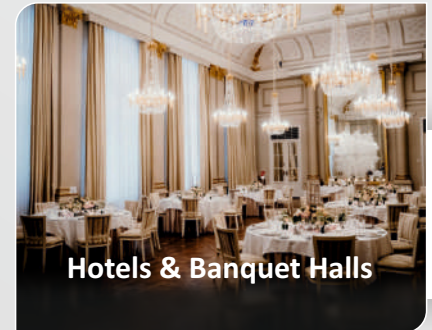
Hotels & Banquet Halls