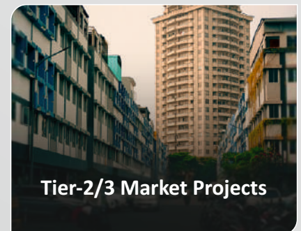
Tier-2/3 Market Projects