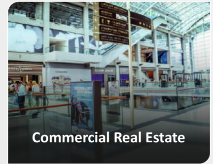
Commercial Real Estate

Above specifications are subject to change without prior notice due to continuous technical development.